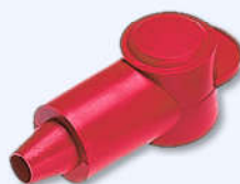
220 Series 20 mm TOD 18 - 2/0 ga cable