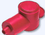
216 Series 16 mm TOD 18 - 2 ga cable