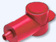
214 Series 14 mm TOD 18 - 2 ga cable