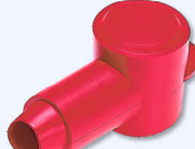
234 Series 34 mm TOD 18 - 4/0 ga cable