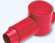
226 Series 26 mm TOD 18 - 2/0 ga cable

The 200 Series terminal insulators work with stud and eyelet terminals.