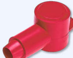
230 Series 30 mm TOD 18 - 2/0 ga cable