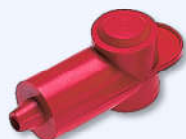
212 Series 12 mm TOD 18 - 2 ga cable