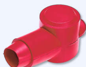
232 Series 32 mm TOD 18 - 4/0 ga cable