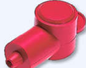
218 Series 18 mm TOD 18 - 2 ga cable