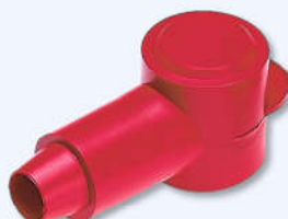
228 Series 28 mm TOD 18 - 2/0 ga cable

The 200 Series is commonly used on inverters, starters, windlasses, chargers, and other high energy connections.