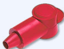
220 Series 20 mm TOD 18 - 2/0 ga cable