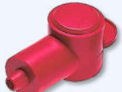
216 Series 16 mm TOD 18 - 2 ga cable