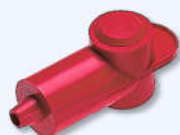
212 Series 12 mm TOD 18 - 2 ga cable