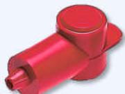
214 Series 14 mm TOD 18 - 2 ga cable