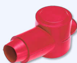
232 Series 32 mm TOD 18 - 4/0 ga cable