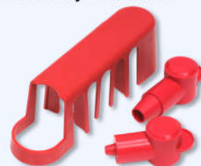
7102030N2 Kit includes cover and (2) 216 Series Insulators

See pages 4 & 5 for 216 Series Insulator sizes